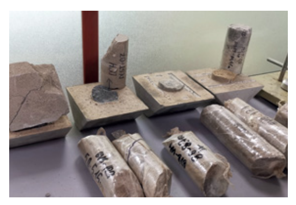
Drill core sample preparation for geotechnical experiment in the laboratory.

ROMA had been engaged by Erdene Resource Development Corporation (TSX:ERD) as the overall project manager to coordinate a consortium of International and Mongolian consultants to deliver the Feasibility Study NI 43-101 Technical Report for the Mongolia Bayan Khundii Gold Project in southwest Mongolia. This report presents the next phase of the project's development with an updated mine design study, FEED for the processing plant and associated infrastructure, a hydrogeological study, detailed waste management plans, and an updated economic model.